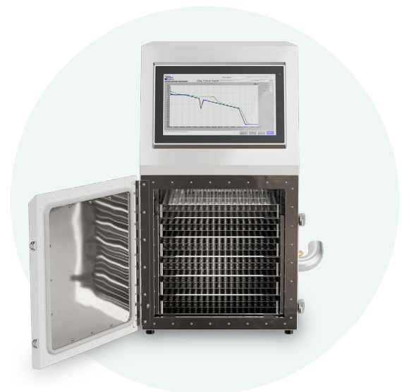
INTERIOR VIEW 67-liter (2.35 cu. ft.) volume inside the chamber