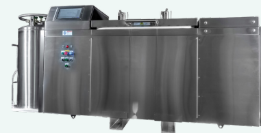
High Capacity Controlled Rate Freezer Up to 781-Liter Capacity