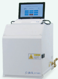
2101 Controlled Rate Freezer 28-Liter Capacity